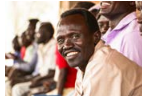
ABOVE Your prayers for Sudan are being answered

Sudanese Christian and Muslim leaders have signed a declaration to work together on promoting religious freedom in a country that has been ruled by oppressive Islamic law for three decades.