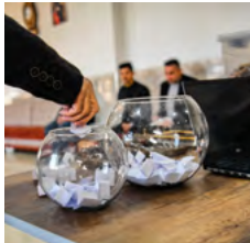
PICTURED Participants enjoy the Bible competition in Iraq

Praise God for the several Christian radio and TV outlets in Lebanon that are able to broadcast the Word of God daily to the wider Arab world. Pray that the message of salvation will reach those who do not yet know the love of Jesus.