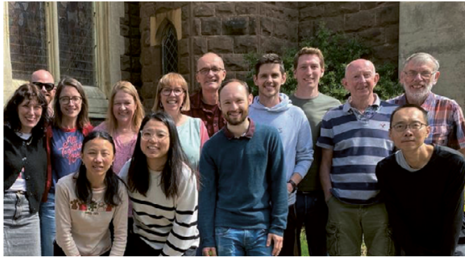
A group from St Stephen's and St Wulstan's Church ran various distances for our persecuted family