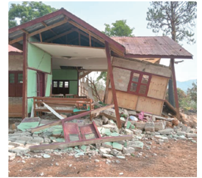
OPPOSITE Believers affected by the earthquake receive groceries you’ve helped provide BELOW The arrival of new toilets ABOVE A church destroyed by the earthquake

“The lives of many believers were affected by the earthquake. When many of their homes were damaged, they struggled to resume their daily normal lives and livelihoods. The food provided was timely. It was