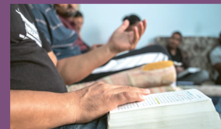
LEFT Believers from a Muslim background gather for a secret house church meeting in North Africa

"Believers often keep their faith hidden, because of these dangers. But I see from my church that this group of converts from a Muslim background is growing. Every month, we add between 10 and 20 people. Despite severe persecution, the movement is growing in Iraq, in Iran and the rest of the region."