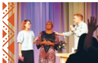
ABOVE, TOP RIGHT Open Doors supporters around the world are praying and speaking out in the Arise Africa campaign