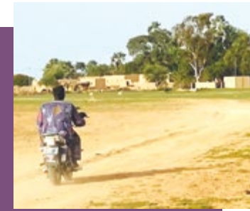
ABOVE Mopti, Mali

It follows reports of the tax being imposed last summer in Dougouténé, another village in Mopti, and there are