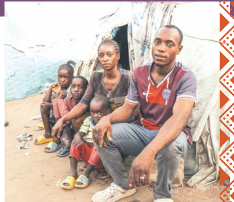
ABOVE Millions of Christians are living in displacement camps across sub-Saharan Africa

The earlier these people go back home, the better for them and the better for the church. They've been there for years. Just imagine a family of five for instance, in