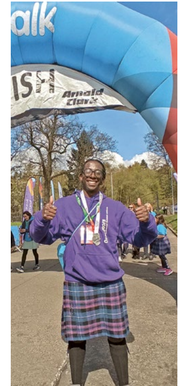
*Names changed for security reasons

Do you feel inspired to fundraise? Go to opendoorsuk.org/fundraise for all you need to get started.