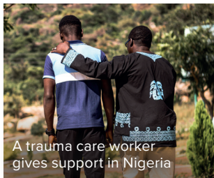
A trauma care worker gives support in Nigeria

a Christian. Pray for Open Doors trauma workers serving survivors of violence and their families. Pray that, through their ministry, many would find healing and hope.