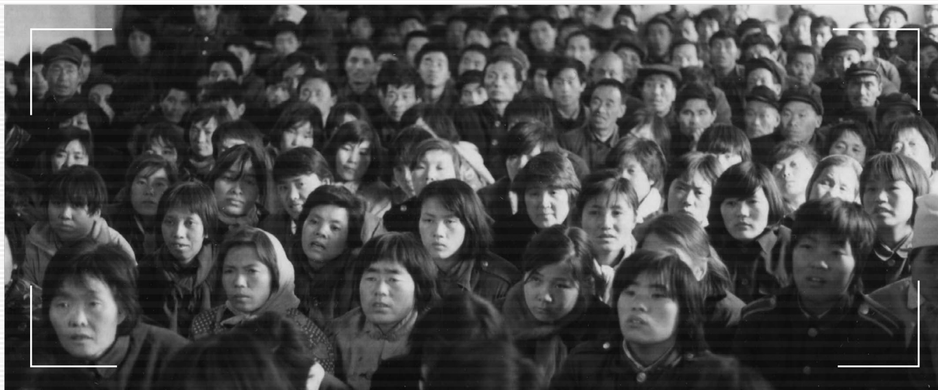
Image: A packed Chinese house church in the late 1980s