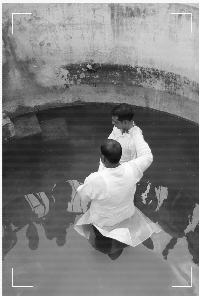
Image: A baptism service for new believers in India

As the session ends, slowly open the curtains, turn their lights back on and return to our own world.