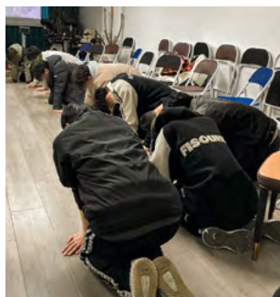
ABOVE An undercover youth prayer meeting in China, earlier this year

Regulations on religion introduced in 2018 include a ban on under-18s attending church. Ask the Holy Spirit to inspire and guide pastors into ways to connect with and disciple children and young people.