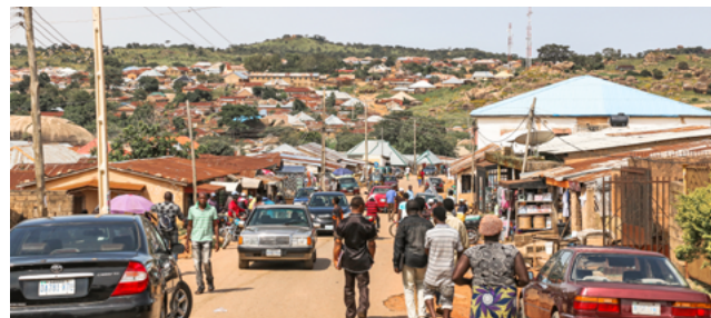
ABOVE Pray for Nigeria as the country prepares to hold elections

General elections are being held in Nigeria on 25 February