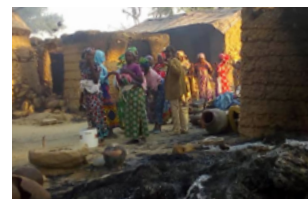
ABOVE A Christian village in Cameroon is burned down by Islamic militants

Violence against Christians in sub-Saharan Africa has reached new heights. Political instability, economic hardship, climate change and the Russian invasion of Ukraine are providing fertile ground for the activities of jihadist groups, criminal gangs and mercenary soldiers, with Christians among those gravely affected and often targeted. Pray for peace and stability in the region.