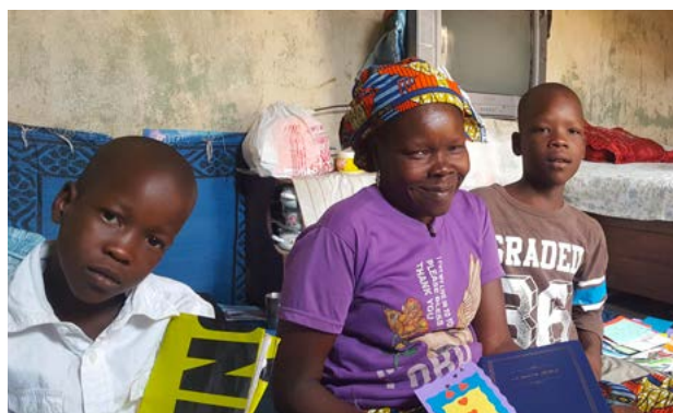
Persecuted Christians in Haoua, Cameroon receive letters of encouragement from Open Doors supporters