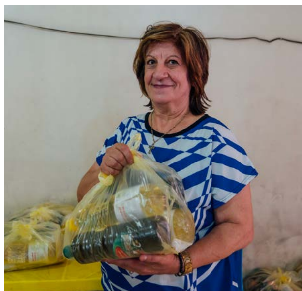
A lady preparing food packages for families in Aleppo, Syria as part of the Centre of Hope activities supported by Open Doors

There is a need to acknowledge that it is simply unreasonable to expect a local faith actor to differentiate between aid and development work and everyday spiritual and pastoral work. As was noted in the 2019 statement by the US Administration, FCO and Wilton Park, 14 "While the principle of