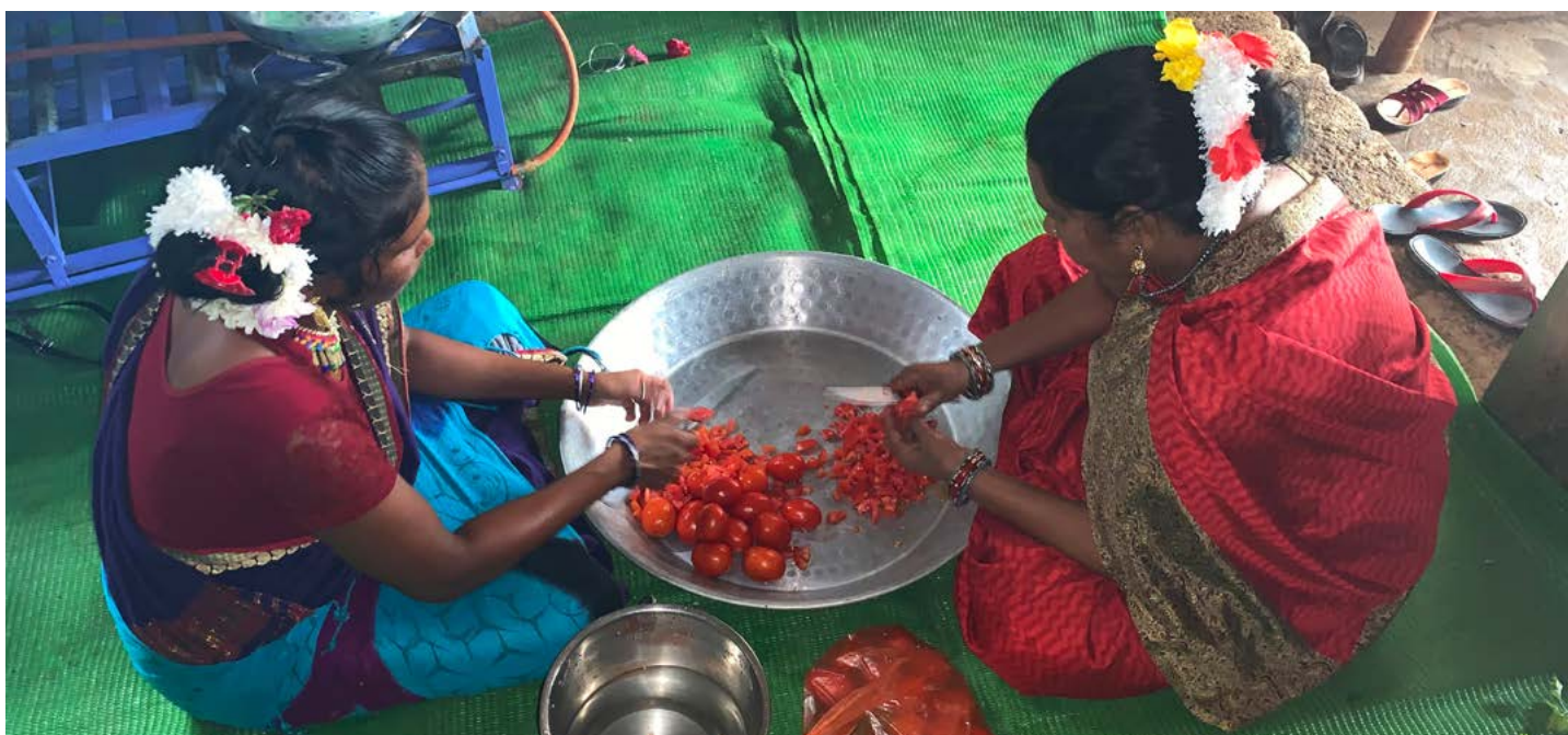
Pictured is a small 'dhaba' or cafeteria providing support to vulnerable women in rural India through the support of Open Doors

The targeted kidnapping, forced marriages and forced conversions of Christian girls in Egypt is