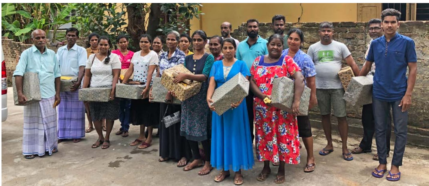
Families of the victims of the Easter Sunday Sri Lanka bombings receiving care boxes from Open Doors' partners

met the leaders of Zion Church to inquire about their immediate needs.