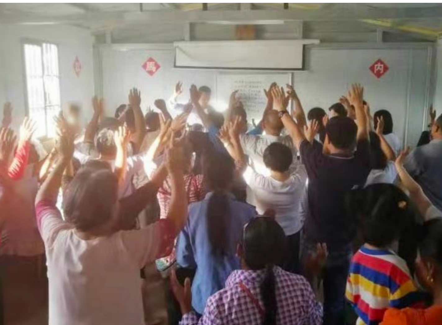
A house church gathering in China

In China, the situation for non-registered churches is difficult. Until recently, Beijing Zion Church was one