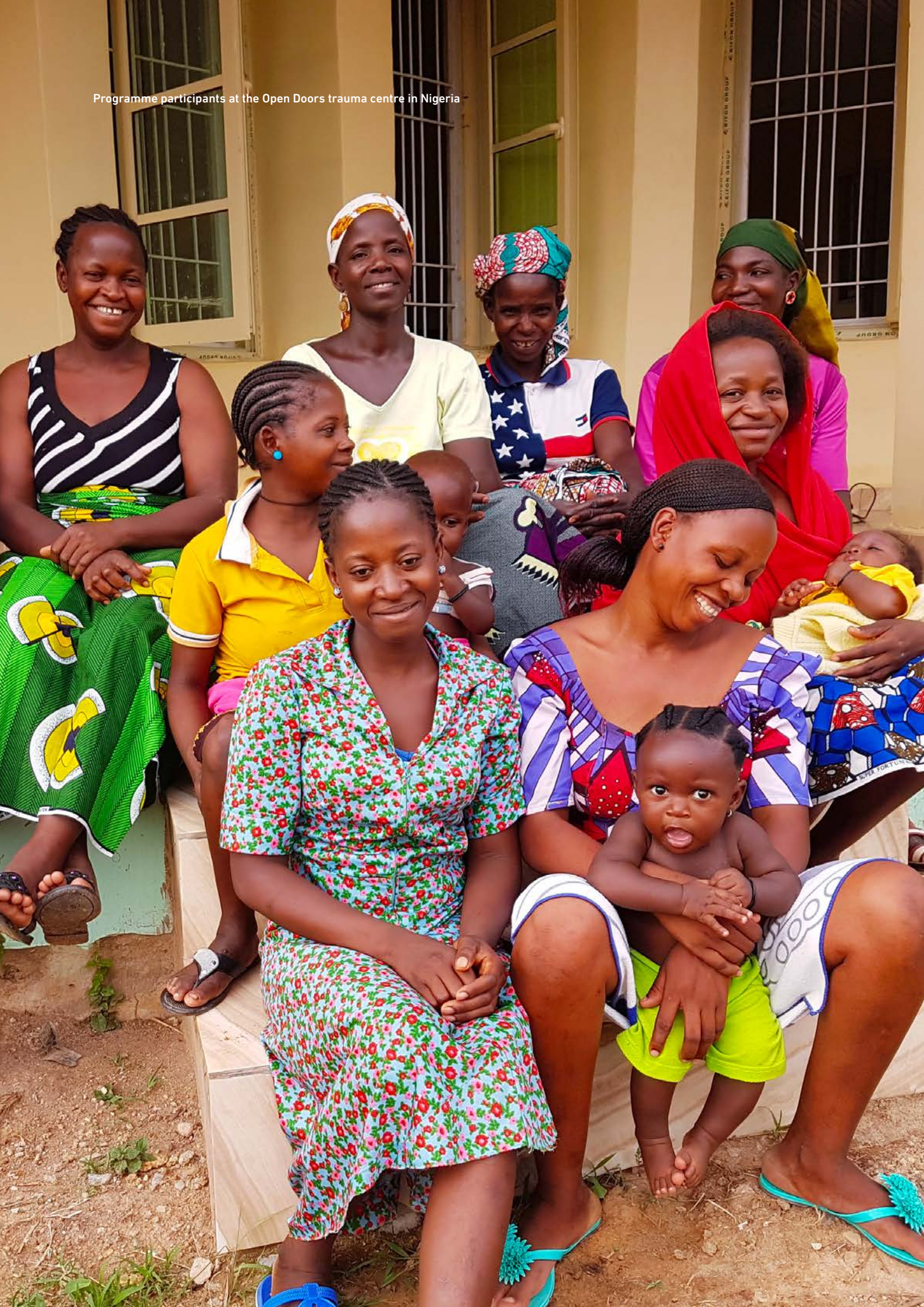
Programme participants at the Open Doors trauma centre in Nigeria