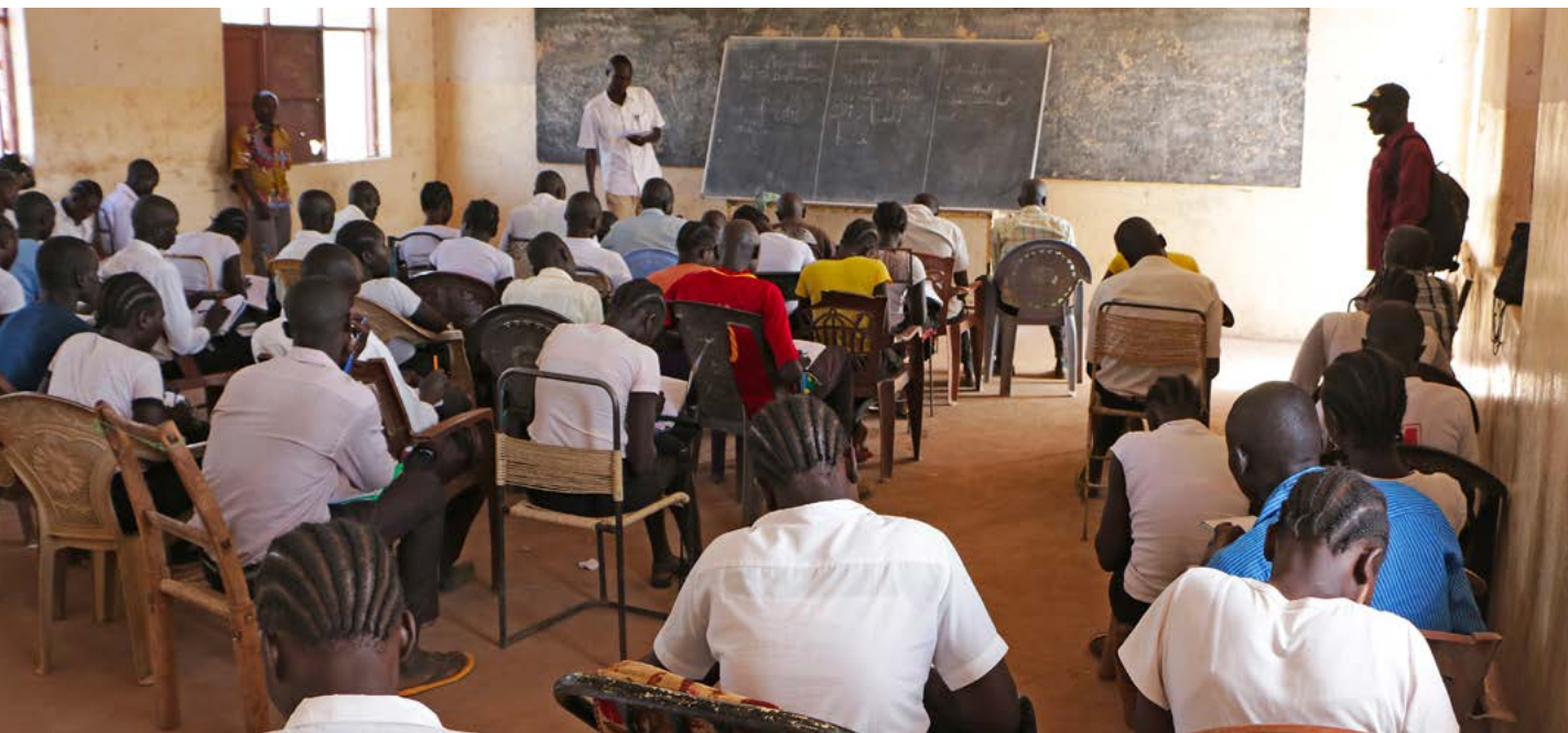
An adult education programme supported by Open Doors taking place in the Nuba Mountains, Sudan