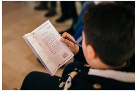
Trauma care and training