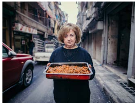
Income-generating projects so people can support their families