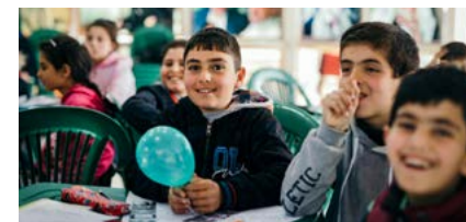
Classes and activities for children who've missed schooling