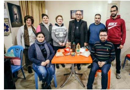
Food and medicine for the most vulnerable