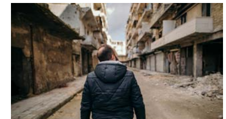
Our vision of God can deepen through stories of courageous faith.