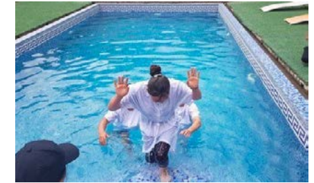
Growth of the church – openly or underground