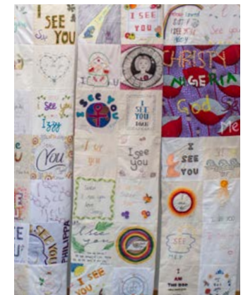
*name changed for security reasons

from Nigeria who attended the petition exhibition in Westminster Abbey's Chapter House, said: "This handmade petition will allow every woman to see that everyone is seeing them." The exhibition was also attended by Prime Minister's